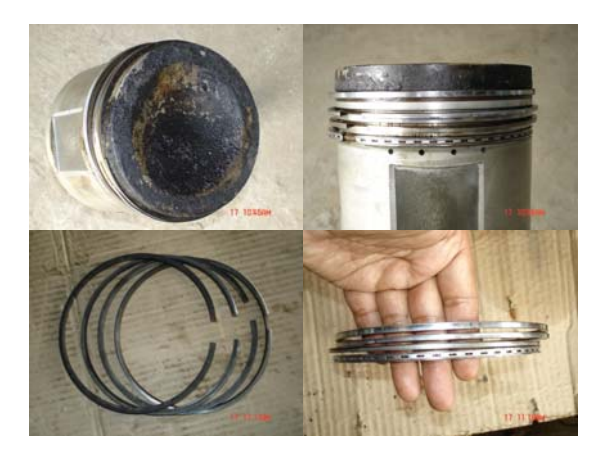
Figure 5: Piston and Piston rings after 5000 hours of operation