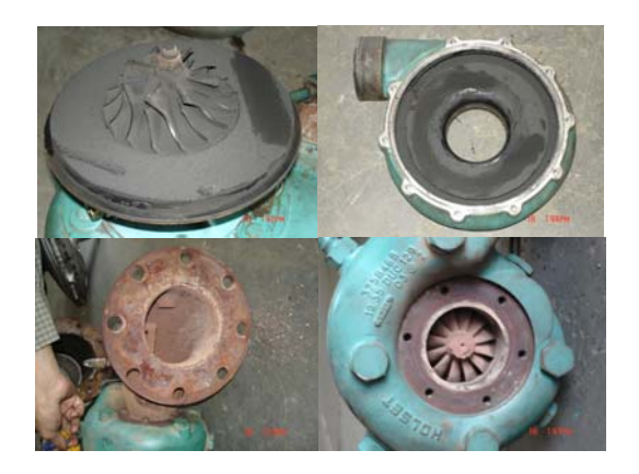
Figure 3: The compressor and turbine after 5000 hours of operation