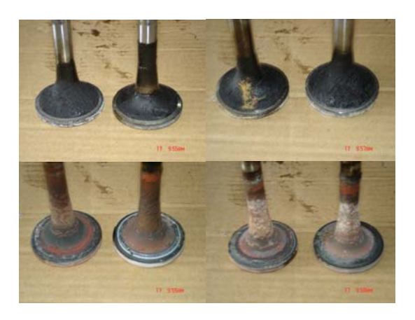
Figure 4: Intake and exhaust valves after 5000 hours